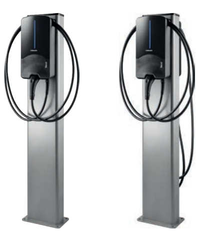
Webasto Stand Solo & Duo