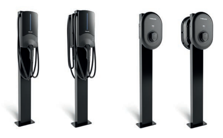
Webasto Stand Slim Solo & Duo